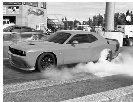
Gratuitous drag car.